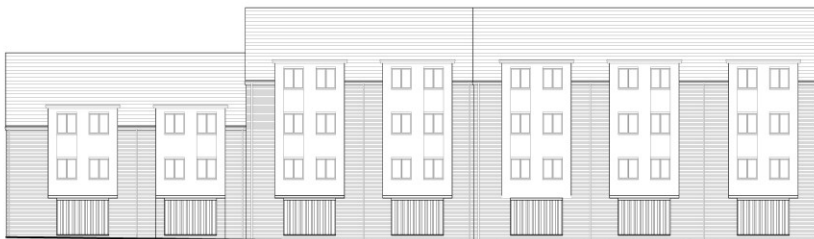
SOUTH ELEVATION (BLOCK B)