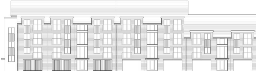
NORTH ELEVATION (BLOCK B)