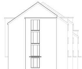
EAST ELEVATION (BLOCK B)